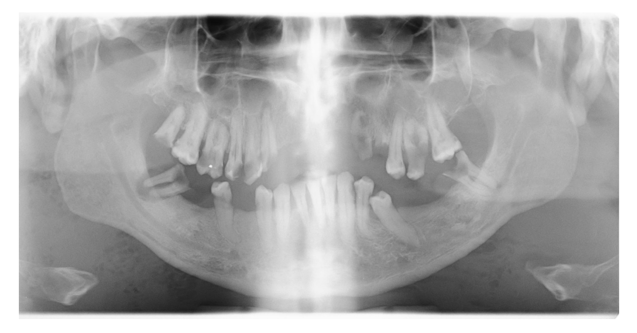
Figure 1. X-ray of the skull—panoramic radiograph. Numerous tooth roots are visible mainly in the mandible accompanied by periapical lesions